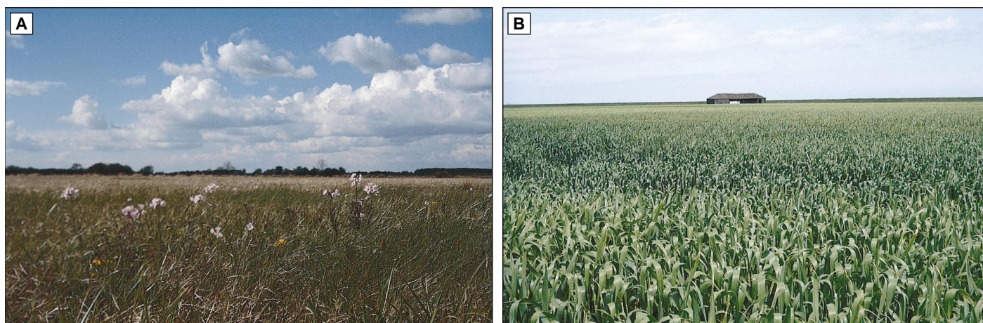
Fig. 2. Many human activities drastically simplify the species richness of ecosystems. (A) shows an ancient hay meadow on the Lower Derwent Ings in North Yorkshire, England. “Ing” is a Viking word meaning flooded meadow. The Ings flood every winter, remain damp in the summer, receive no fertilizer or pesticide inputs, and are cropped for hay and grazed in traditional land use practices that have their origins in Viking Britain. The resulting seminatural ecosystems are extremely rich in plants, insects, and birds. They are also very easily destroyed and drastically simplified (B) by draining, ploughing, the elimination of winter flooding, and conversion to arable agriculture. Similar changes in land use are severely altering the biological diversity of ecosystems all over the world.

Given the frequently strong effects of species composition and diversity on ecosystem processes seen in experimental studies, what can we expect in the future? Land use change currently has the largest effect on biodiversity (Fig. 2), but changes in atmospheric composition and climate will likely have increasing impacts. The current rapid rates of deforestation, urbanization, and overexploitation, whether through overgrazing or overfishing (61), strongly affect species composition and diversity. Areas in which there is substantial nitrogen deposition also exhibit reduced diversity (62).